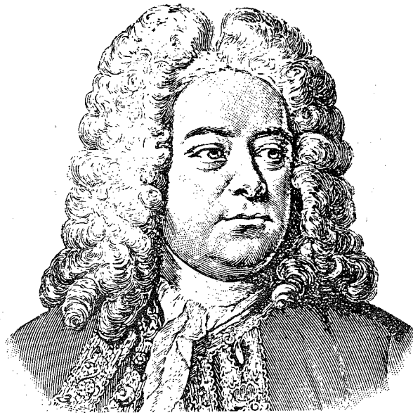
HANDEL FEBRUARY 23, 1685

AMERICAN GUILD OF ORGANISTS WORCESTER CHAPTER MECHANICS HALL 321 MAIN STREET WORCESTER, MA 01608