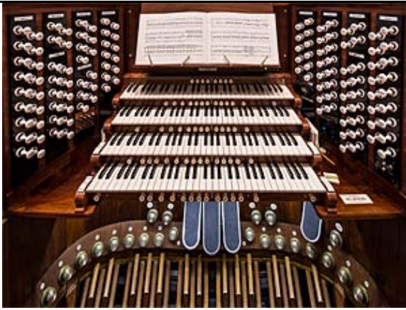
Console of the newly refurbished pipe organ

Royal Festival Hall's magnificent organ has been undergoing a six-year restoration, thanks to the Heritage Lottery Fund and our incredibly supportive audiences. To celebrate its return to full glory, Southbank Centre is presenting Pull Out All The Stops – an organ festival on an unprecedented scale.