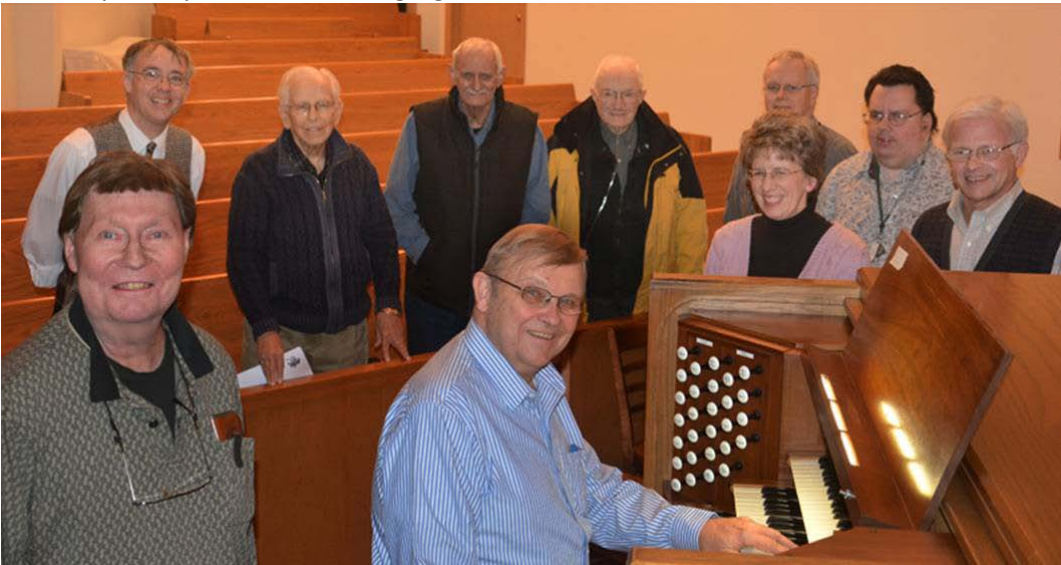
Salem Covenant Church Open Console

Join us April 7 7pm at United Congregational (one of the instruments on our " Underutilized Instruments " list!